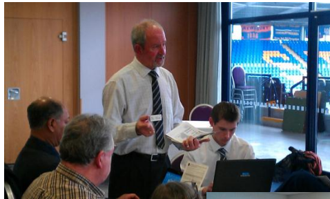
Big Debate on Welfare Reform